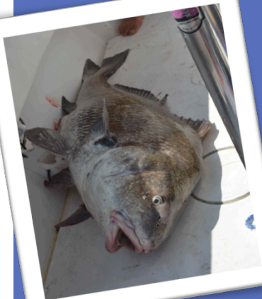
Jerry Hughes had a busy month, "accidentally" catching a 52" black drum on a flounder rig, and later a 52 lb cobia on a charter out of Oregon Inlet.